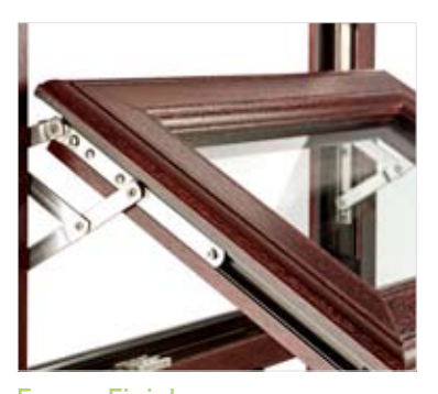
Frame Finish All frames feature 100% lead-free virgin skin surfaces. Frames are also fully welded for enhanced mechanical performance and aesthetic appeal.