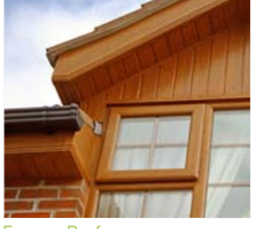
Energy Performance Designed for enhanced energy performance, Inliten double glazed windows feature Soft Coat glass and offer WER "A" ratings as standard.